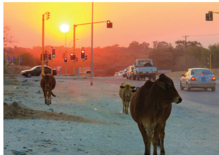
ABOVE Expect cattle to wander across the roads in Maun at any moment.

The rise in overnighting tourists has resulted in culture-focused excursions around Maun and a new one-stop-info-shop beside the airport - Explore Maun - for activities and accommodation bookings. Silvester Mafosi, of Third Kind Travel & Tours, is also a font of much local knowledge. He links social enterprise with tourism, in collaboration with Safari Destinations and Travel For Impact, which distributes $1 per bed night pledges from camps, lodges, hotels and tour operators. They've created a three-hour immersive local experience, which averts the focus from sympathy-inducing school visits, to authentic and often hilarious rural experiences, such as visiting a cattle station and being asked to milk a cow.